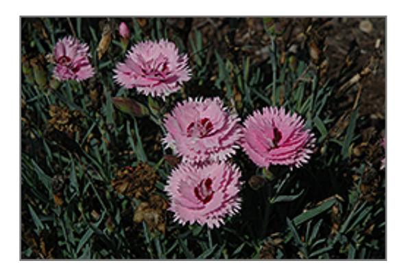
EverLast Lavender plus Eye Pinks flowers