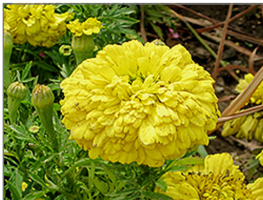
French Marigold flowers

French Marigold will grow to be about 12 inches tall at maturity, with a spread of 12 inches. When grown in masses or used as a bedding plant, individual plants should be spaced approximately 10 inches apart. Its foliage tends to remain dense right to the ground, not requiring facer plants in front. This fast-growing annual will normally live for one full growing season, needing replacement the following year.