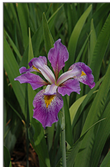
Southern Blue Flag Iris flowers