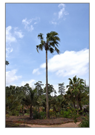
Taraw Palm