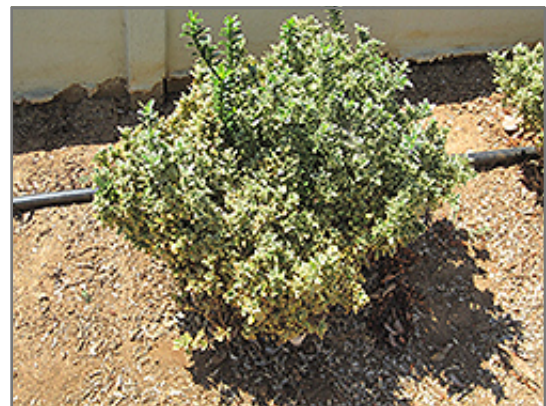
Variegated Boxleaf Japanese Euonymus