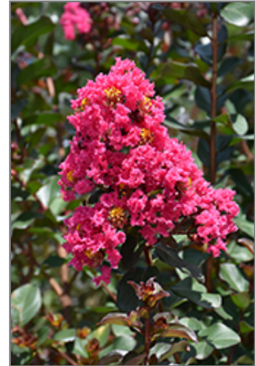
Pink Velour Crapemyrtle flowers