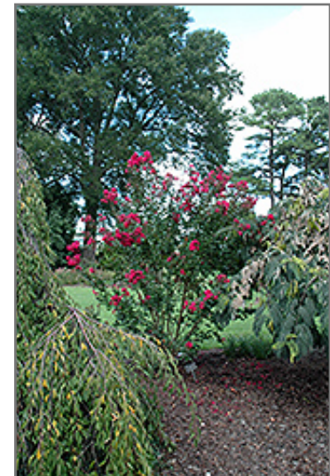
Pink Velour Crapemyrtle in bloom