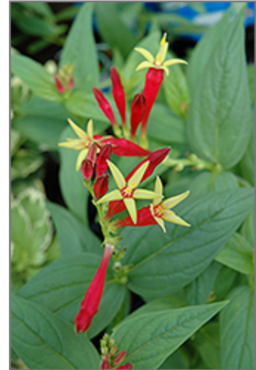
Indian Pink flowers

Indian Pink is recommended for the following landscape applications;