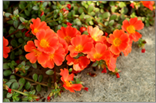
RioGrande Orange Portulaca flowers

RioGrande Orange Portulaca is recommended for the following landscape applications;