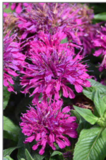
Grape Gumball Beebalm flowers

This variety forms a dense mound of purplish-pink flowers on well branched, strong stems, over lush dark green foliage that has an excellent resistance to powdery mildew; great for massing along borders