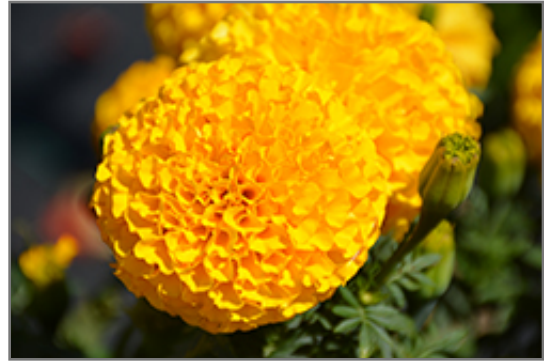
Taishan Gold Marigold flowers

Taishan Gold Marigold is recommended for the following landscape applications;