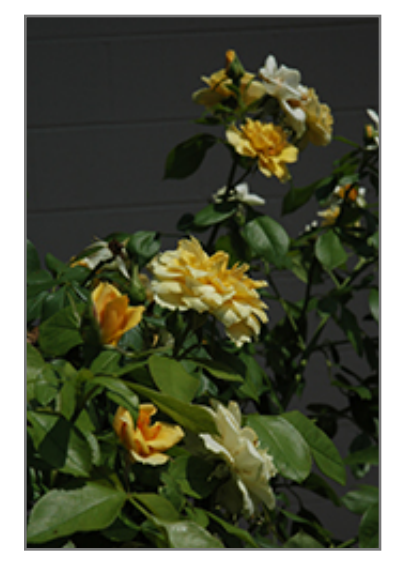
Tequila Gold Rose flowers