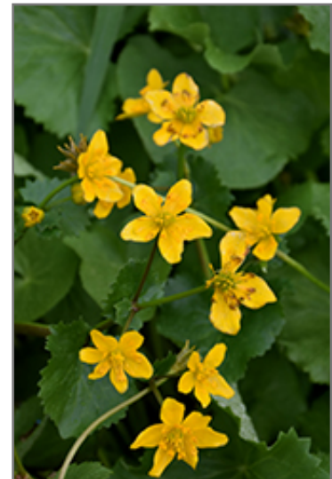
Marsh Marigold flowers