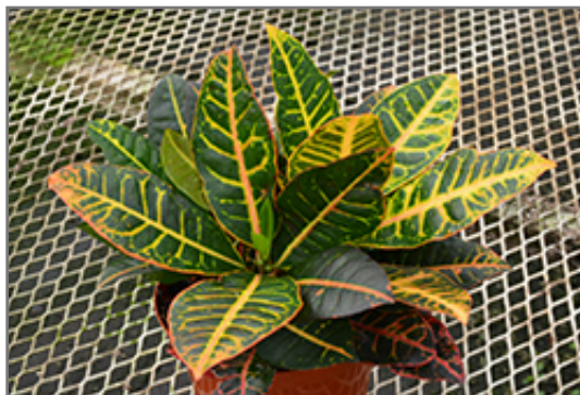
Petra Variegated Croton in full