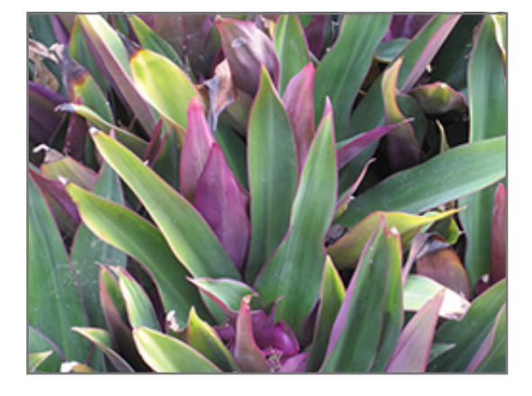
Moses In The Cradle foliage