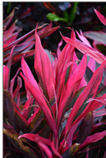
Maria Cordyline foliage

When grown indoors, Maria Cordyline can be expected to grow to be about 5 feet tall at maturity, with a spread of 3 feet. It grows at a medium rate, and under ideal conditions can be expected to live for approximately 10 years. This houseplant will do well in a location that gets either direct or indirect sunlight, although it will usually require a more brightly-lit environment than what artificial indoor lighting alone can provide. It does best in average to evenly moist soil, but will not tolerate standing water. The surface of the soil shouldn't be allowed to dry out completely, and so you should expect to water this plant once and possibly even twice each week. Be aware that your particular watering schedule may vary depending on its location in the room, the pot size, plant size and other conditions; if in doubt, ask one of our experts in the store for advice. It is not particular as to soil type or pH; an average potting soil should work just fine.