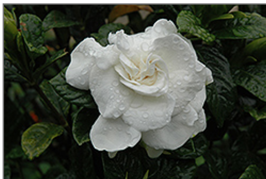
Everblooming Gardenia flowers

A prolific and constant bloomer with large, sweetly fragrant, elegant white flowers contrasted by deep green foliage; a wonderful indoor accent plant