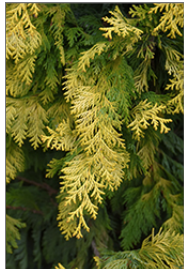
Cripps Gold Falsecypress foliage