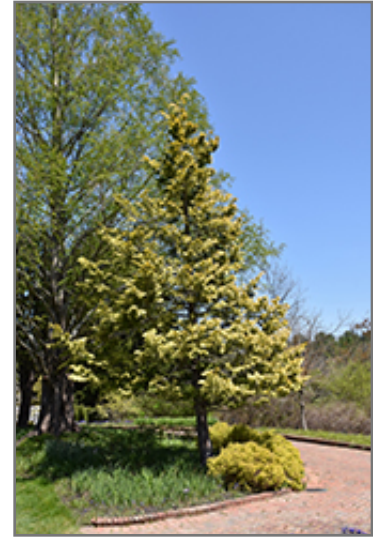
Cripps Gold Falsecypress

This tree does best in full sun to partial shade. It prefers to grow in average to moist conditions, and shouldn't be allowed to dry out. It is not particular as to soil type or pH. It is highly tolerant of urban pollution and will even thrive in inner city environments, and will benefit from being planted in a relatively sheltered location. Consider applying a thick mulch around the root zone in winter to protect it in exposed locations or colder microclimates. This is a selected variety of a species not originally from North America.