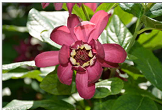
Aphrodite Sweetshrub flowers