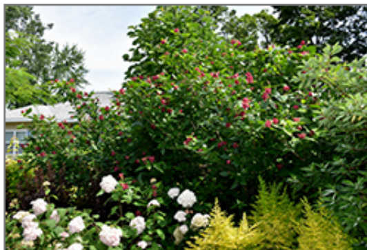
Aphrodite Sweetshrub in bloom