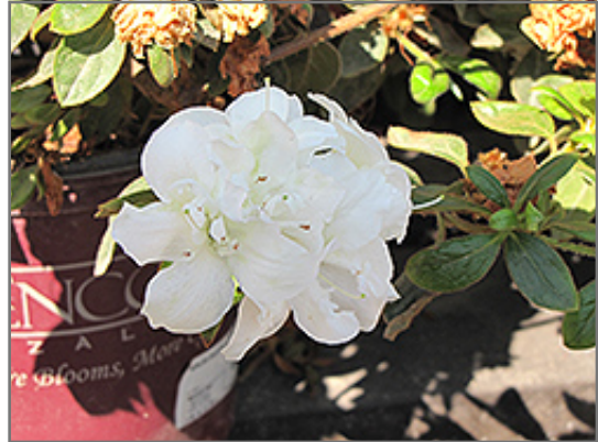
Encore Autumn Moonlight Azalea flowers

Encore Autumn Moonlight Azalea will grow to be about 5 feet tall at maturity, with a spread of 4 feet. It tends to be a little leggy, with a typical clearance of 1 foot from the ground, and is suitable for planting under power lines. It grows at a slow rate, and under ideal conditions can be expected to live for 40 years or more.