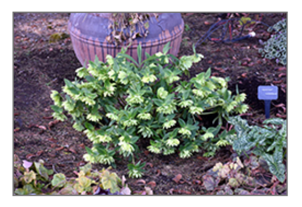
Winter Jewels Jade Tiger Hellebore in bloom