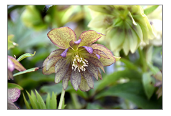
Winter Jewels Jade Tiger Hellebore flowers