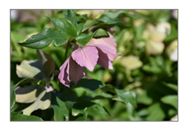
Pine Knot Select Hellebore flowers