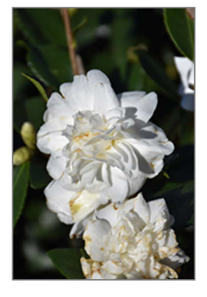
Winter's Snowman Camellia flowers