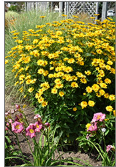
Summer Sun False Sunflower in bloom