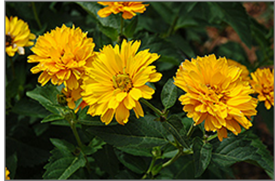
Summer Sun False Sunflower flowers

Summer Sun False Sunflower is recommended for the following landscape applications;