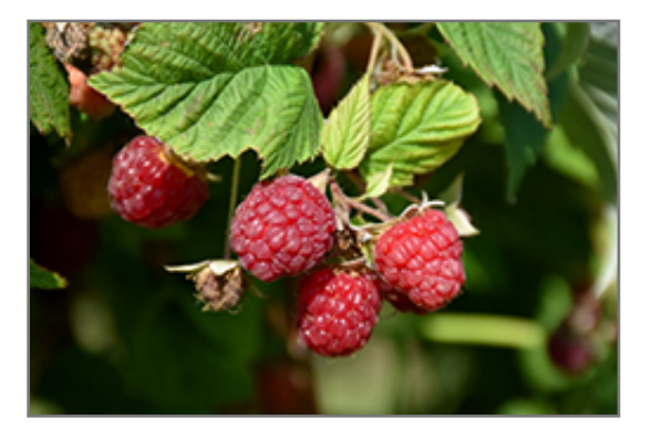
Prelude Raspberry fruit

Prelude Raspberry has rich green deciduous foliage on a plant with an upright spreading habit of growth. The fuzzy oval compound leaves do not develop any appreciable fall color. It features an abundance of magnificent red berries in early summer.