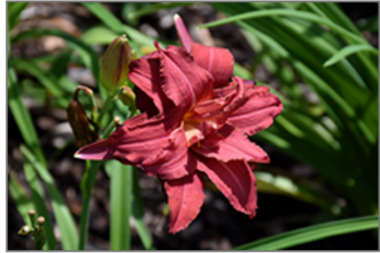
Double Pardon Me Daylily flowers