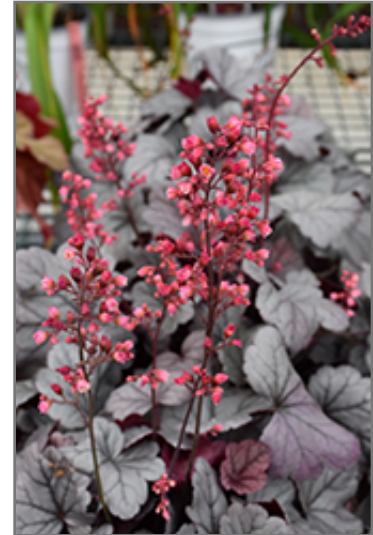
Dolce Silver Gumdrop Coral Bells flowers

This is a relatively low maintenance plant, and should be cut back in late fall in preparation for winter. It is a good choice for attracting hummingbirds to your yard. It has no significant negative characteristics.