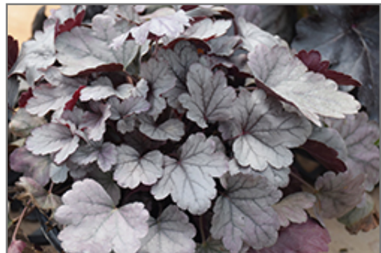
Dolce Silver Gumdrop Coral Bells foliage