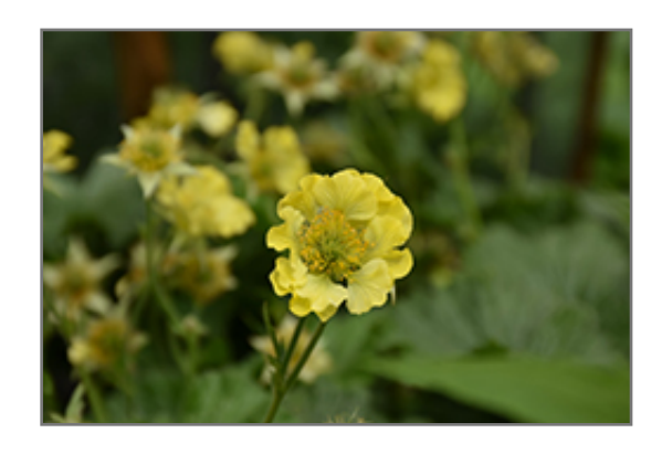
Cocktails Banana Daiquiri Avens flowers