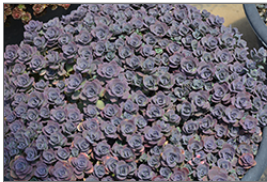
SunSparkler Blue Elf Sedoro