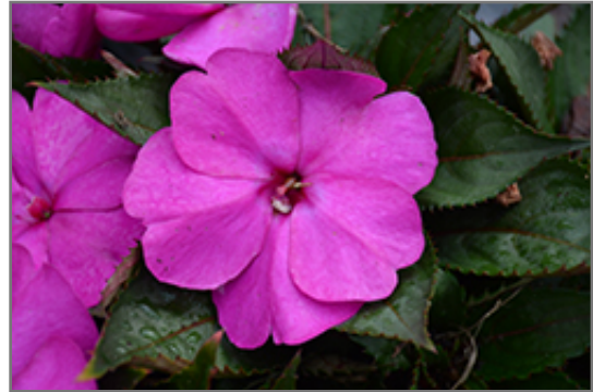
SunPatiens Compact Purple New Guinea Impatiens flowers

This plant will require occasional maintenance and upkeep, and should not require much pruning, except when necessary, such as to remove dieback. It has no significant negative characteristics.