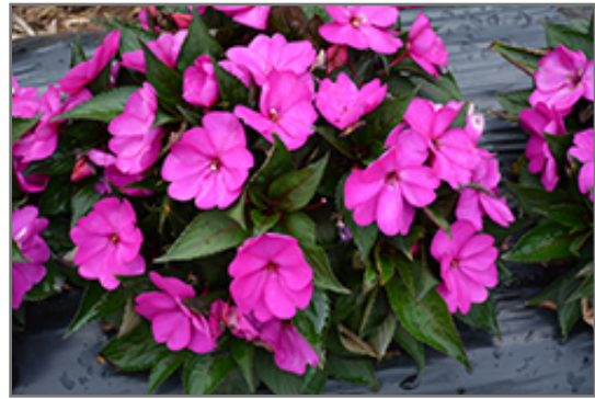
SunPatiens Compact Purple New Guinea Impatiens in bloom

SunPatiens Compact Purple New Guinea Impatiens is a fine choice for the garden, but it is also a good selection for planting in outdoor containers and hanging baskets. It can be used either as 'filler' or as a 'thriller' in the 'spiller-thriller-filler' container combination, depending on the height and form of the other plants used in the container planting. It is even sizeable enough that it can be grown alone in a suitable container. Note that when growing plants in outdoor containers and baskets, they may require more frequent waterings than they would in the yard or garden.