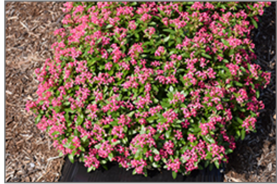
Soiree Kawaii Coral Vinca in bloom

Soiree Kawaii Coral Vinca is a fine choice for the garden, but it is also a good selection for planting in outdoor containers and hanging baskets. Because of its trailing habit of growth, it is ideally suited for use as a 'spiller' in the 'spiller-thriller-filler' container combination; plant it near the edges where it can spill gracefully over the pot. Note that when growing plants in outdoor containers and baskets, they may require more frequent waterings than they would in the yard or garden.