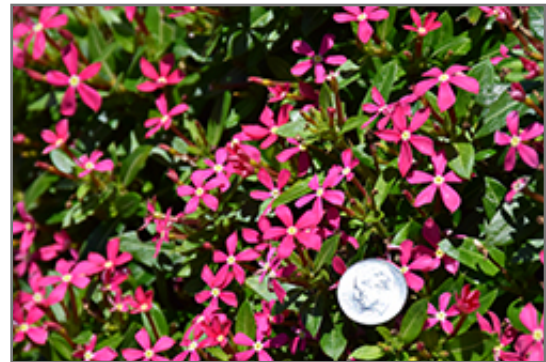
Soiree Kawaii Coral Vinca flowers