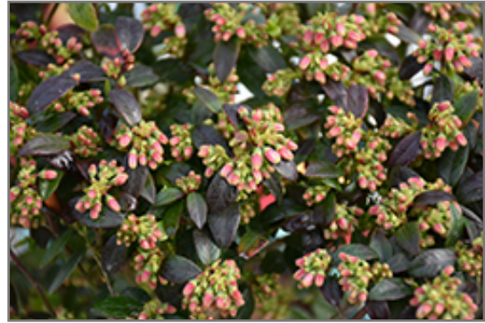
Blueberry Glaze Blueberry flowers

This is a multi-stemmed deciduous shrub with a mounded form. Its average texture blends into the landscape, but can be balanced by one or two finer or coarser trees or shrubs for an effective composition. This is a relatively low maintenance plant, and usually looks its best without pruning, although it will tolerate pruning. It is a good choice for attracting birds to your yard. It has no significant negative characteristics.