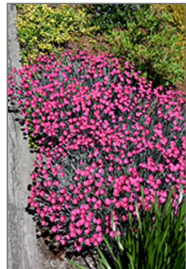
Wicked Witch Pinks in bloom