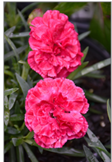
Fruit Punch Raspberry Ruffles Pinks flowers