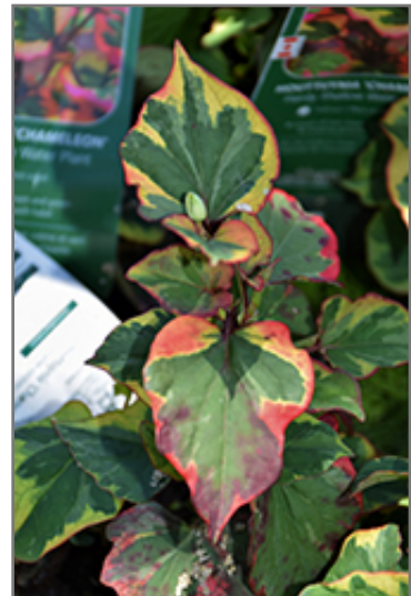
Variegated Chameleon Plant foliage