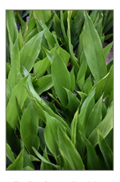
Tiny Tank Cast Iron Plant foliage

When grown indoors, Tiny Tank Cast Iron Plant can be expected to grow to be about 16 inches tall at maturity, with a spread of 24 inches. It grows at a medium rate, and under ideal conditions can be expected to live for approximately 10 years. This houseplant performs well in both bright or indirect sunlight and strong artificial light, and can therefore be situated in almost any well-lit room or location. It does best in average to evenly moist soil, but will not tolerate standing water. The surface of the soil shouldn't be allowed to dry out completely, and so you should expect to water this plant once and possibly even twice each week. Be aware that your particular watering schedule may vary depending on its location in the room, the pot size, plant size and other conditions; if in doubt, ask one of our experts in the store for advice. It is not particular as to soil type or pH; an average potting soil should work just fine.