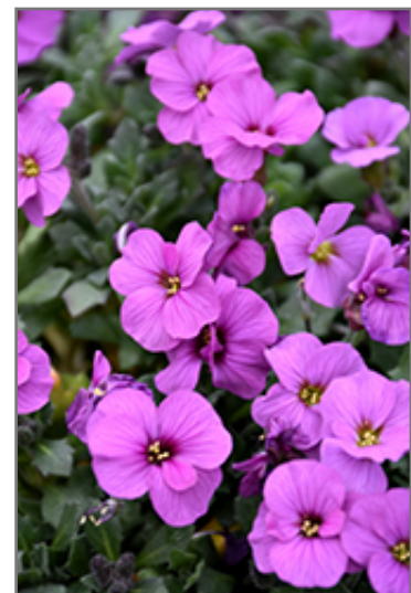
Axcent Antique Rose Rock Cress flowers