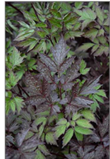
Black Negligee Bugbane foliage