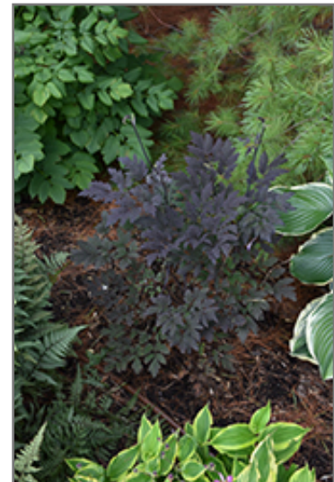
Chocoholic Bugbane