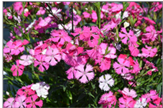
Rockin' Pink Magic Pinks flowers