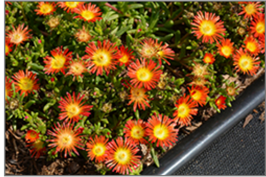
Delmara Red Ice Plant flowers

Delmara Red Ice Plant will grow to be only 4 inches tall at maturity extending to 6 inches tall with the flowers, with a spread of 15 inches. When grown in masses or used as a bedding plant, individual plants should be spaced approximately 12 inches apart. Its foliage tends to remain low and dense right to the ground. It grows at a fast rate, and under ideal conditions can be expected to live for approximately 5 years. As an evergreen perennial, this plant will typically keep its form and foliage year-round.