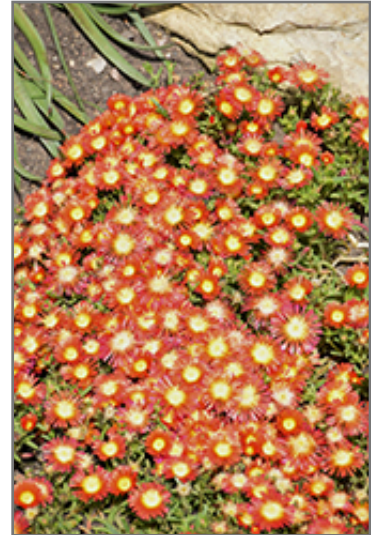
Delmara Red Ice Plant

This is a relatively low maintenance plant, and is best cleaned up in early spring before it resumes active growth for the season. It is a good choice for attracting bees and butterflies to your yard. It has no significant negative characteristics.