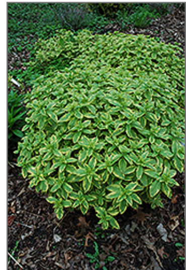
Golden Alexander Loosestrife