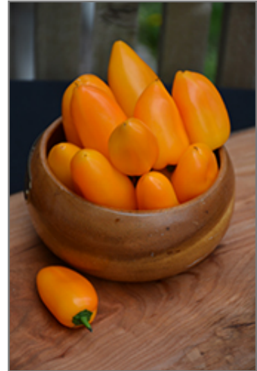
Lunchbox Yellow Sweet Pepper fruit

Lunchbox Yellow Sweet Pepper will grow to be about 3 feet tall at maturity, with a spread of 18 inches. When planted in rows, individual plants should be spaced approximately 18 inches apart. This vegetable plant is an annual, which means that it will grow for one season in your garden and then die after producing a crop.