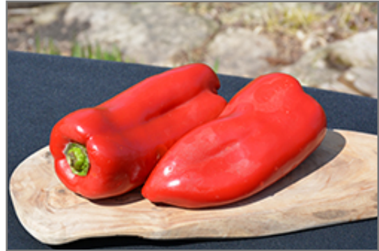
Gypsy Sweet Pepper fruit