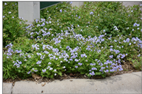
Creeping Jacob's Ladder in bloom