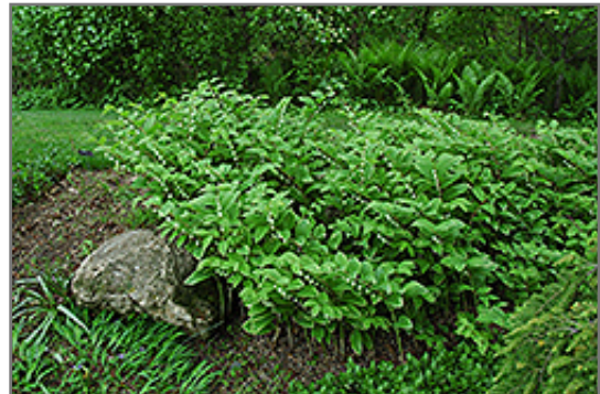
Variegated Solomon's Seal in bloom