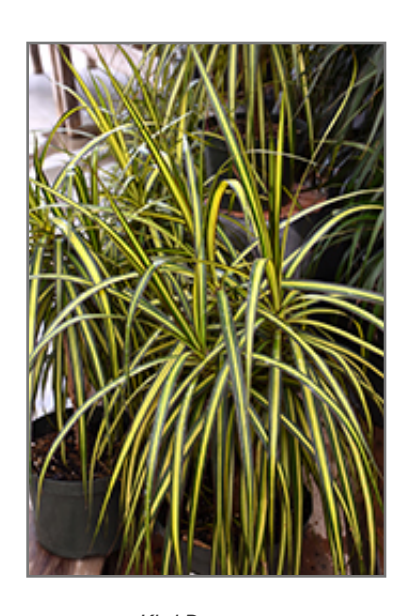
Kiwi Dracaena

When grown indoors, Kiwi Dracaena can be expected to grow to be about 6 feet tall at maturity, with a spread of 3 feet. It grows at a medium rate, and under ideal conditions can be expected to live for approximately 10 years. This houseplant performs well in both bright or indirect sunlight and strong artificial light, and can therefore be situated in almost any well-lit room or location. It does best in average to evenly moist soil, but will not tolerate standing water. The surface of the soil shouldn't be allowed to dry out completely, and so you should expect to water this plant once and possibly even twice each week. Be aware that your particular watering schedule may vary depending on its location in the room, the pot size, plant size and other conditions; if in doubt, ask one of our experts in the store for advice. It is not particular as to soil type or pH; an average potting soil should work just fine.