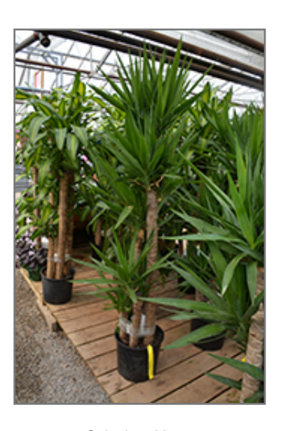
Spineless Yucca

When grown indoors, Spineless Yucca can be expected to grow to be about 4 feet tall at maturity, with a spread of 4 feet. It grows at a slow rate, and under ideal conditions can be expected to live for approximately 20 years. This houseplant requires direct sun for optimal performance, and should therefore be situated in a room that gets bright sunlight for a good part of the day; it is not a good choice for rooms lit only by artificial light. It prefers dry to average moisture levels with very well-drained soil, and may die if left in standing water for any length of time. This plant should be watered when the surface of the soil gets dry, and will need watering approximately once each week. Be aware that your particular watering schedule may vary depending on its location in the room, the pot size, plant size and other conditions; if in doubt, ask one of our experts in the store for advice. It is not particular as to soil pH, but grows best in sandy soil. Contact the store for specific recommendations on pre-mixed potting soil for this plant.