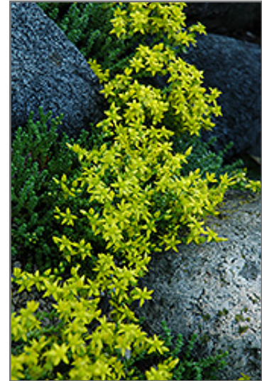
Six Row Stonecrop flowers