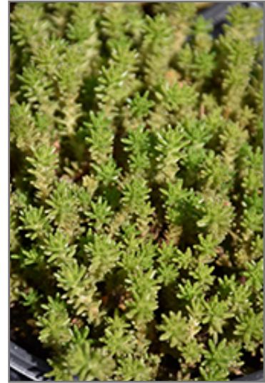
Six Row Stonecrop foliage

Six Row Stonecrop is a fine choice for the garden, but it is also a good selection for planting in outdoor pots and containers. Because of its spreading habit of growth, it is ideally suited for use as a 'spiller' in the 'spiller-thriller-filler' container combination; plant it near the edges where it can spill gracefully over the pot. Note that when growing plants in outdoor containers and baskets, they may require more frequent waterings than they would in the yard or garden.