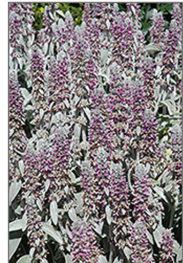
Lamb's Ears flowers