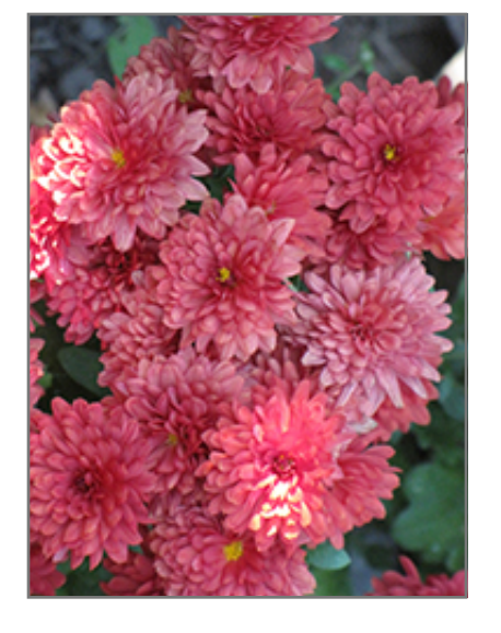
Wanda Red Chrysanthemum flowers